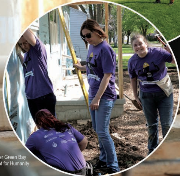
Greater Green Bay Habitat for Humanity