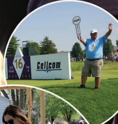
LPGA Thornberry Creek Classic