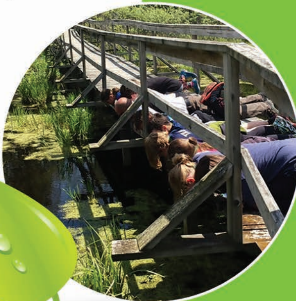
Woodland Dunes Nature Center

CELLCOM'S RECYCLING PROGRAM HAS GENERATED $484,373 FOR LOCAL CHARITIES