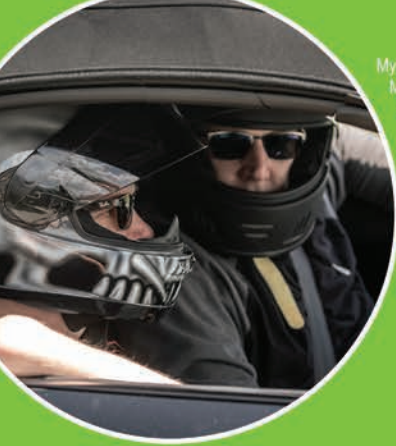
My Team Triumph/Lamers Motor Racing Driving Experience