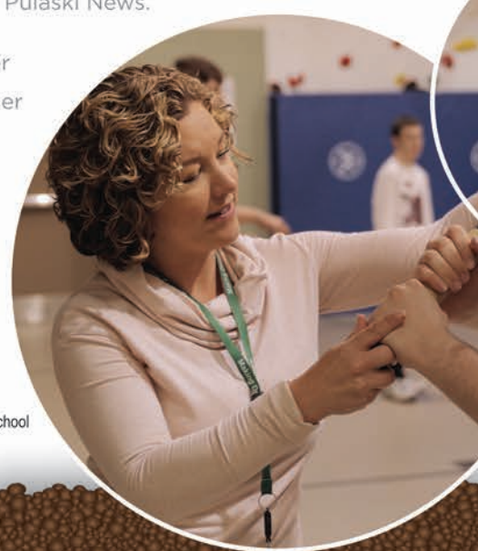
Sybil Hoppe School

Nsight was also proud to further the efforts of area Parent Teacher Organizations, booster clubs, youth sports and school fundraisers across our service area.