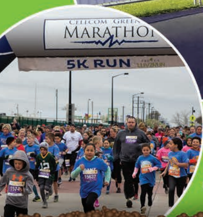
Cellcom Green Bay Marathon/WPS Kid's Run