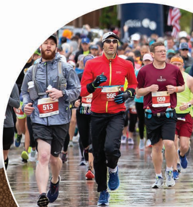
Cellcom Green Bay Marathon