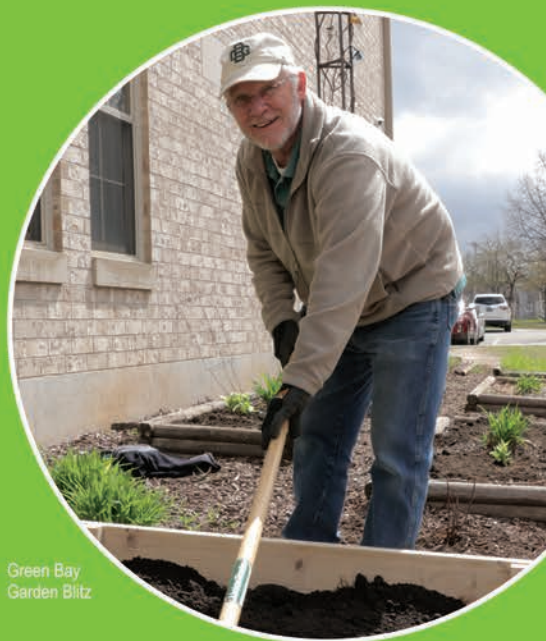
Green Bay Garden Blitz

In 2019 a total of $37,398 was awarded in Cellcom Green Gifts to 32 local organizations. With Cellcom's financial support, nonprofit organizations can continue to make great strides in protecting and caring for our environment. Funded projects included community gardens, monitoring water quality, Fox River clean up, creative educational programming and using solar energy as an alternative to fossil fuels.