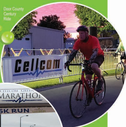
Door County Century Ride

SINCE ITS INCEPTION 20 YEARS AGO, THE CELLCOM GREEN BAY MARATHON HAS DONATED $1,523,268 TO ITS CHARITY PARTNERS